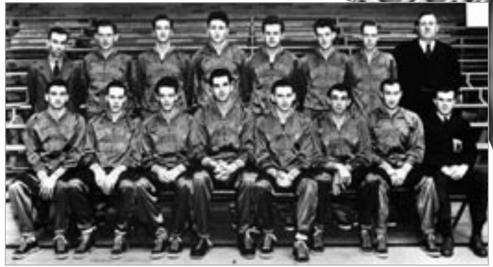
1941 basketball team (NCAA runner up)