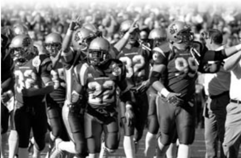
2003 Rose Bowl team