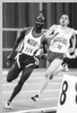
Bernard Lagat 2000 (Bronze medal) & 2004 (Silver Medal) Olympian, NCAA Indoor and Outdoor champion, NCAA Indoor Male Athlete of the Year, Pac-10 Athlete of the Year.