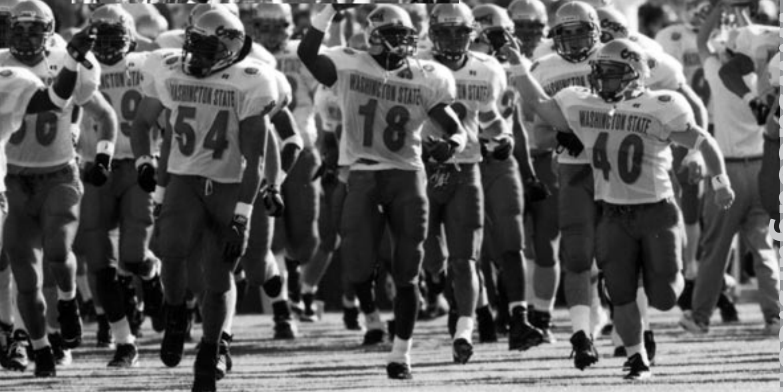
1998 Rose Bowl team