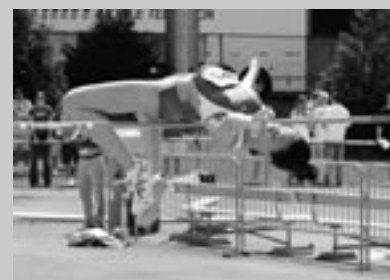
Whitney Evans 2003 NCAA high jump champion; eight-time All-American.

As recently as the 2002-03 season, WSU was represented by 10 of its 17 sports programs in NCAA postseason competition.