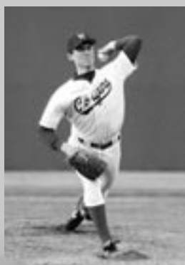
John Olerud 1988 NCAA Player of the Year, only pitcher in NCAA history to win 15 games and hit 20 or more home runs (15-0, 23 homers in 1988) in the same season.